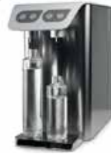
HOTEL & HOSPITALITY (HO.RE.CA.)