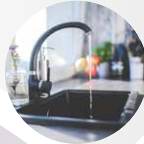
RESIDENTIAL SECTOR - HOME DRINKING