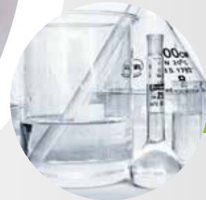
PHARMA & LAB.